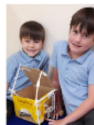
D&T: Exploring frames