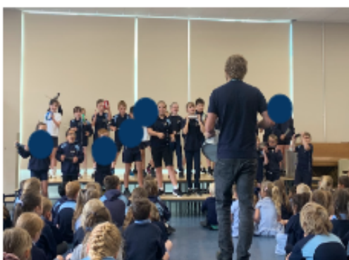
Music: Performing Samba to the rest of the school!