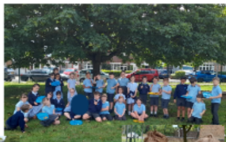
Science: Investigating seed dispersal by collecting seeds around the field.